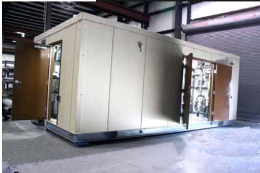
Modular Chiller Central Plant w/ Turbocor Compressor